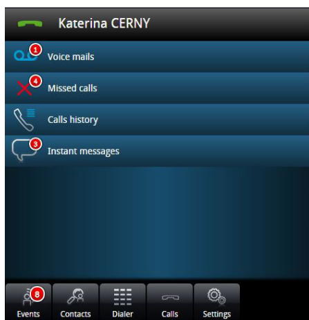
My IC Web Homepage

Employees have increased flexibility for participating in the workforce by combining the right device to suit their context with the right services for maximum efficiency. Another key asset is mobility, which allows workers to remain closely connected to their company, ensuring business continuity. The Alcatel-Lucent My IC Web application is designed for small- and medium-sized businesses (SMBs). It helps to significantly increase employee productivity by providing a full browser-based application that connects to their company's Alcatel-Lucent OmniPCX ® Office Rich Communication Edition (RCE) communication server and delivers communication services from an easy-to-use interface.